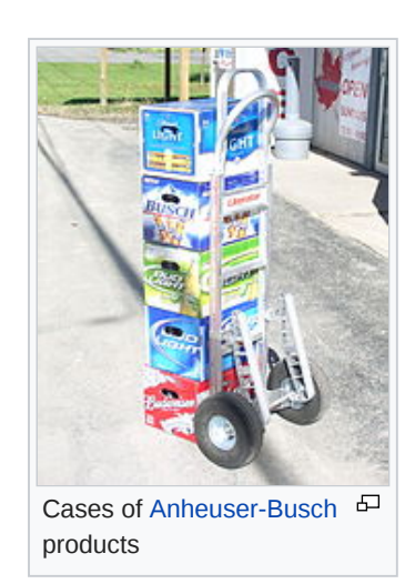
The company's Phoenix distribution plant occupies a number of acres and is marked by a giant Budweiser sign.<sup>[13]</sup> In addition to beer, Hensley also distributes energy drinks, root beer, liquor, and wines, some of which are distributed from a warehouse in Tucson.<sup>[24]</sup> The move into wines

By 2007 Hensley employed 650 people, sold about 23 million cases of beer a year to over 5,000 retail accounts producing revenues of $340 million, and a 60 percent or more market share in its target area. [10][14] Beverage industry analysts estimated the company's value in 2008 at more than $250 million. [20] Despite the late-2000s recession, which resulted in a rare decline in sales volume for the company, [5] revenues rose slightly to $350 million by 2009[21] and employment was still 650 in 2010. [22] It subsequently rose to 800 by 2015. [5] The company said it had record revenues in 2014 but did not disclose the amount. [5] The company's workforce is dominated by men in their twenties. [23] The company's facilities include its own printing shop. It operates a fleet of some 750 trucks and other vehicles and conducts its own training program for commercial driver's licenses. [5]